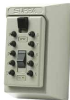
Lockboxes for house keys